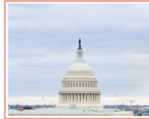
View of Capitol Building