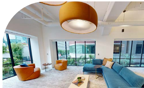
*Disclaimer: Photos representative of future build-out